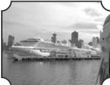
Cruise ship in Vancouver Harbour