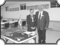
Grand Forks Elks meetings the first Tuesday of each month 7:30 p.m. at the Seniors Hall at City Park.

If you would like to attend as a guest or want further information contact: