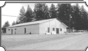
Official Opening: Saturday, October 17, 2009 when the Mayor of Salmon Arm, Marty Boostma cut the ribbon.