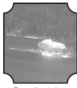
Tracey Arm Iceberg