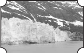
Glacier in Glacier Bay Jerry & Bev Wernicke