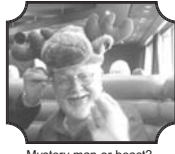
Mystery man or beast?