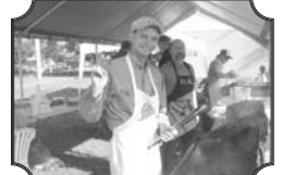
Canada Day Pancake Breakfast