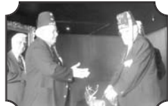
Installation of Officers