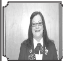
Brother and Sister Elks, Ladies of the Royal Purple

When I joined the Elks in 2000, being the President of the B.C. Elks Association had never crossed my mind. I had never belonged to an organization before, heck I had never really volunteered before, and now here I am doing something that I have come to love.