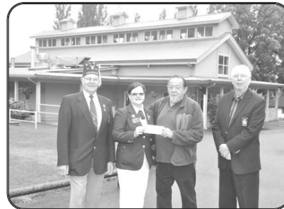
ALDERGROVE ELKS NO. 66