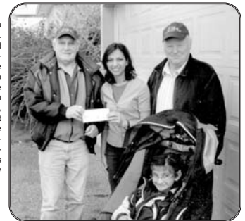
Cloverdale Elks No. 335